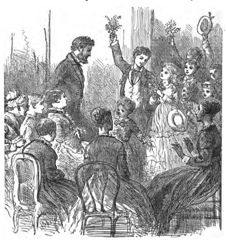
"THE COUSINS HAD BEEN A-MAYING."

and sighed, and telegraphed to one another that none of them would complain if not chosen, or ever try to